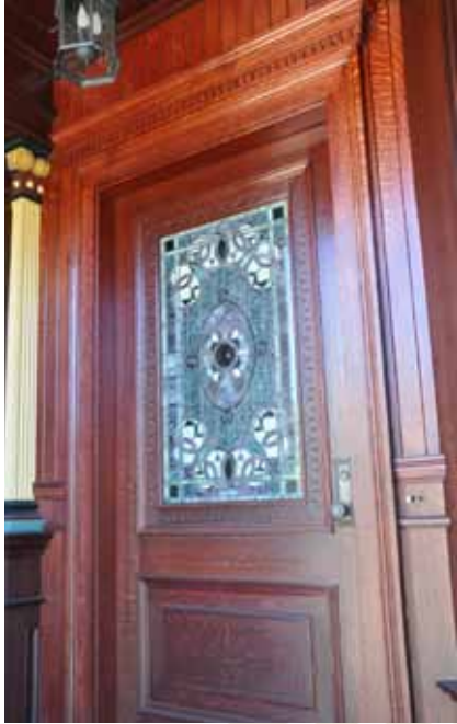
Victorian entry door, detail showing refreshed carving and restored original lock set.