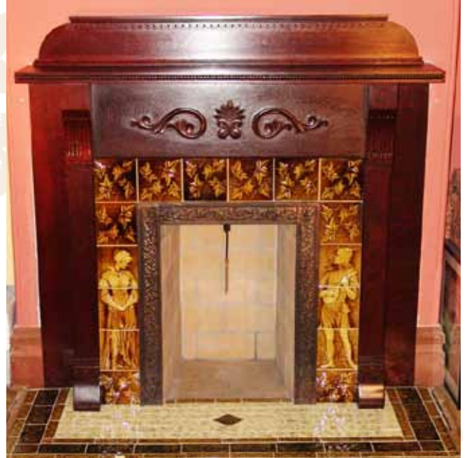
Victorian mantle after paint removal and refinishing.