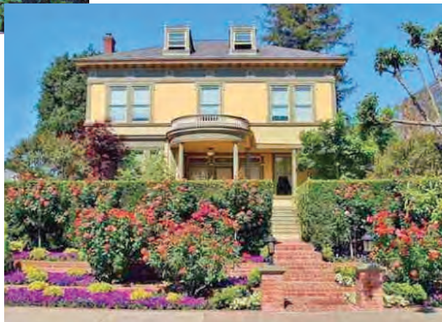
Right: The finished project at 1217 Sherman Street, Alameda involved construction repair, lead based paint removal, repainting and color design.