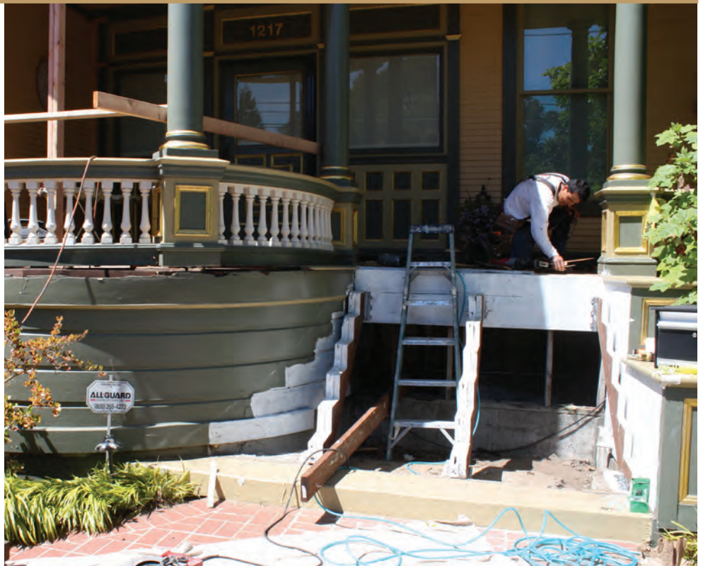
Work-in-progress: The removal & replacement of dry rotted stairs. PNPC-Inc. handles many home restoration needs beyond the paint.