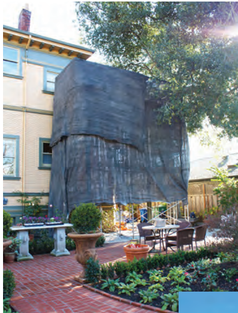
Above: Netting for lead based paint containment & removal.

The Alameda Point development plans are still evolving. Please watch for future developments.