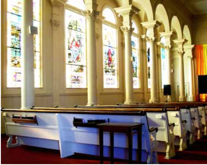
Interiors of Alameda Historic Landmarks intended for public use, such as the First Presbyterian Church on Santa Clara Avenue, should be protected under the Preservation Ordinance.