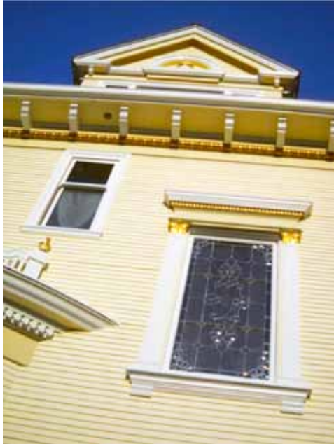
Details on the exterior. This view shows the upper stairwell window with Corinthian pilasters; the bay-window cornice with dentils and urn finial; and the roof eave with modillion brackets.