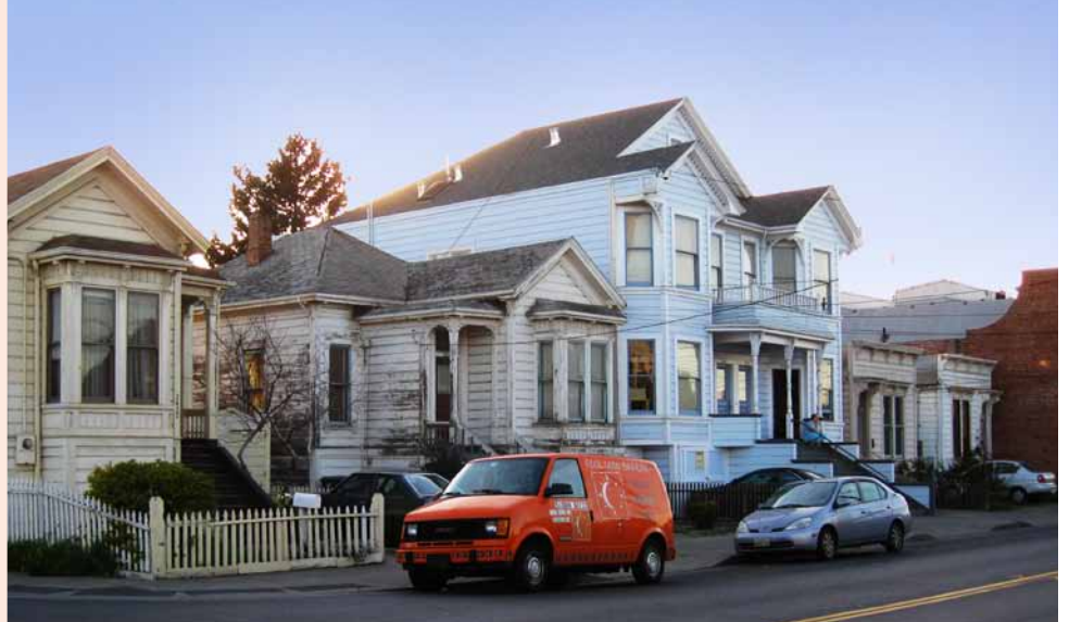
Five houses at the southwest corner of Buena Vista Avenue and Foley Street are in a proposed mixed use area located behind Park Street commercial zoning.

The Note reads: "When incorporated into development plans for adjoining Park Street General parcels, MUN parcels shall be governed by land use and site development regulations for the Park Street General".