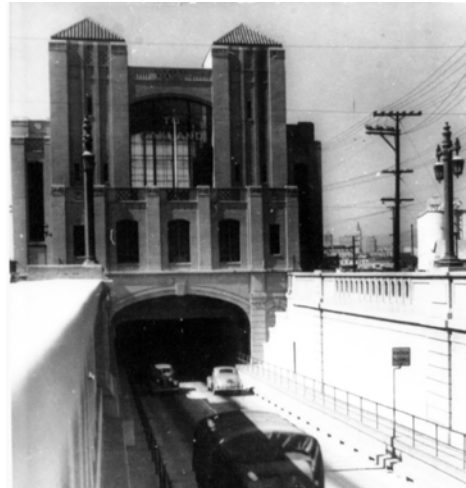
1930s image of the Posey Tube Portal.

A full size tower would serve as a visual anchor for the entire length of the street, solidify the