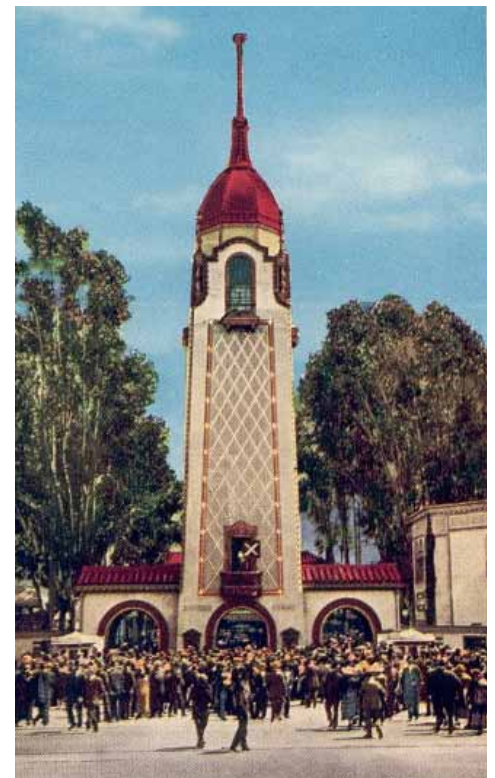
The tower entrance to Neptune Beach once graced the foot of Webster Street.