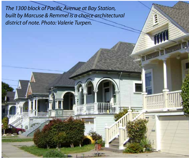
The 1300 block of Pacific Avenue at Bay Station, built by Marcuse & Remmel is a choice architectural district of note.