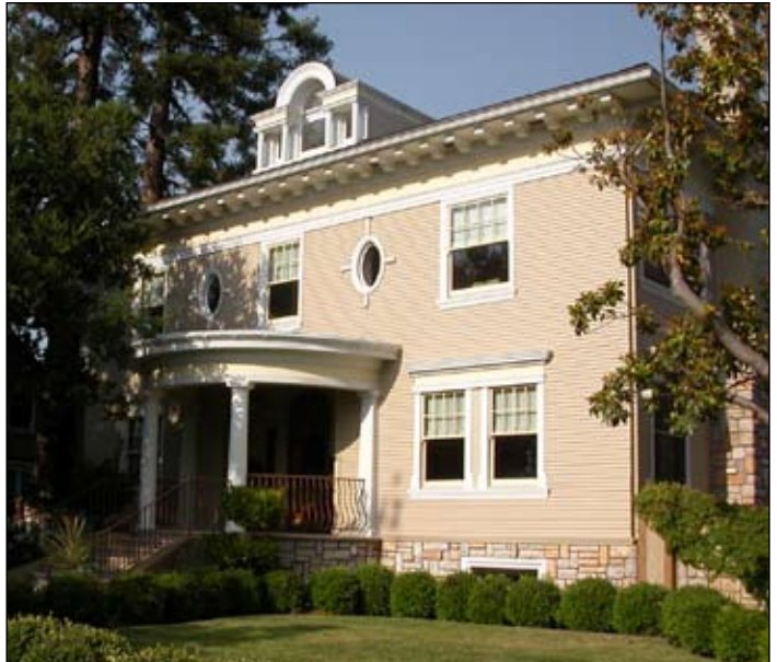
Four of the six houses featured on the 2008 Alameda Legacy Home Tour