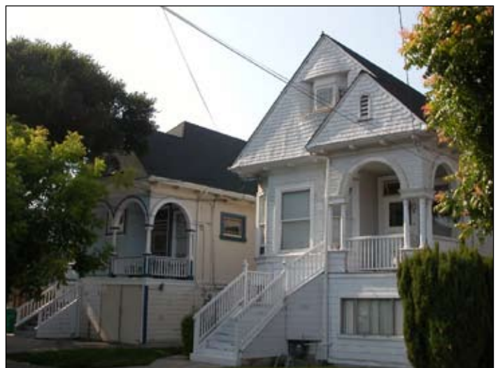
left & bottom: Marcuse & Rimmel cottages, 1300 block Pacific Avenue, 1895 top: Parapet detail, Del Monte Warehouse, Buena Vista Avenue mid: Partial view of façade, Del Monte Warehouse