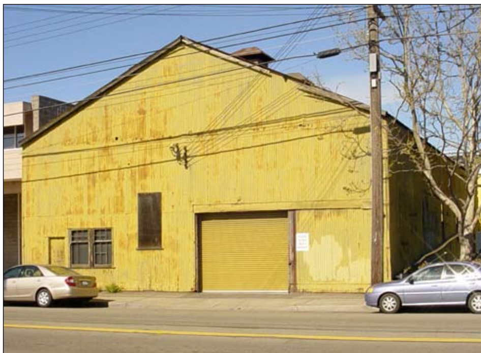
The former Van Niel Foundry and Oakland Brass Foundry, 2319 Clement Street, as it appeared shortly before its demolition in June 2008.

The former Paceco office building on Blanding Avenue and the associated parcels on Clement Avenue were acquired in 2001 by another booming local business, Perforce Software. So the story has come full circle, from the arrival in Alameda of the Dow Pumping Engine Company, to the establishment of the Van Niel Foundry by one of its foremen, the acquisition of the Dow and foundry properties by Paceco, and advent of Perforce Software.