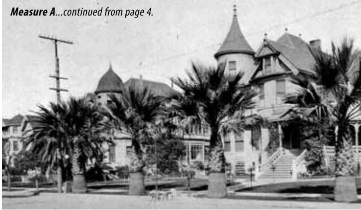
Measure A...continued from page 4.