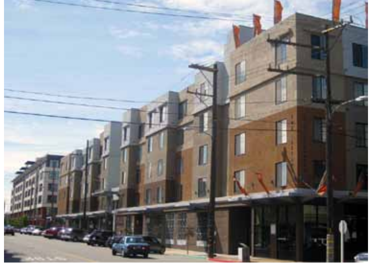
Picture this: Park and Webster streets without Article 26. Preserve Alameda, Vote NO on Z!