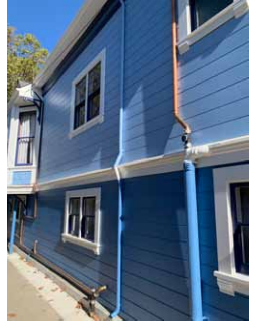
After 50 years of deferred maintenance, 40 feet of siding and 8 windows were replaced. The plumbing was updated and moved inside the wall. A new paint scheme transformed the west side of this Marcuse & Remmel house.