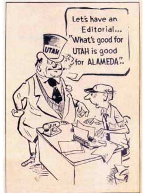
Early radical preservationism: Anti-Utah political cartoon by the Civil League of Alameda from the 1955 battle over South Shore.

Now, while I'm sure that no respectable legislator would ever engage in quid pro quo transactions, I'm not sure how else to describe what they've been doing. I certainly never ascribed demand for housing to developer greed nor to their financing campaigns. The demand for affordable housing is real and legitimate, but developers can't afford to just build affordable housing, there's no money in it, nor tax revenue for the City. Here's the real reason for the Council to place the repeal of Article 26 in the ballot, to remove the only obstacle to rezoning and approve indiscriminate building. If Alamedans don't want increasing congestion and deterioration of the lifestyle they want to preserve, they will vote no on Z!