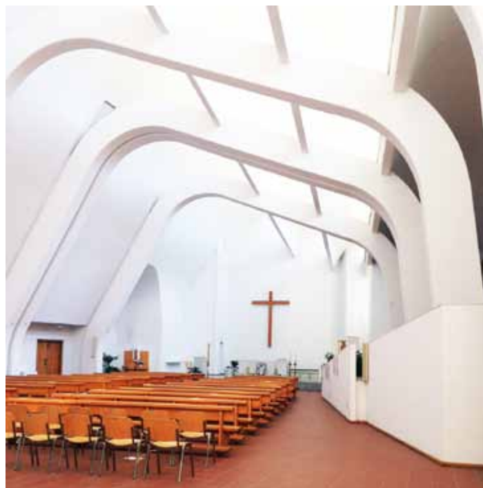
Church of Santa Maria Assunta, Riola di Vergato, Italy (completed in 1978). Alvar Aalto, architect.

in 1978. As an Italian native, I was beyond intrigued to learn how an architect who had put the humanity of the individual at the center of his architecture could translate his design principles on foreign soil, and especially Italy, which has a robust modernist tradition, known as Rationalism.