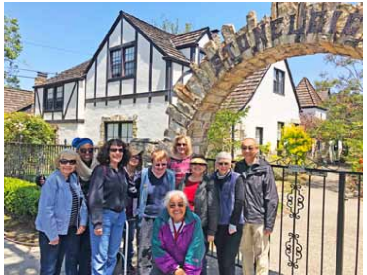
Mastick students had a magical time visiting Stonehenge during their final class.