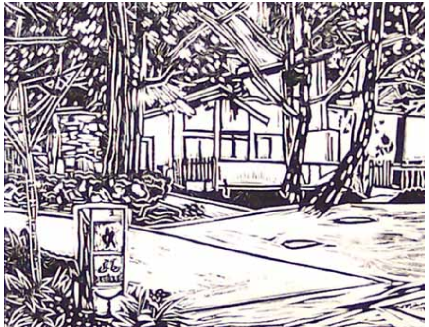
Dappled in Harbor Bay

working with adults and seniors. She currently has over 35 students who study through morning and afternoon classes and independent lab time.