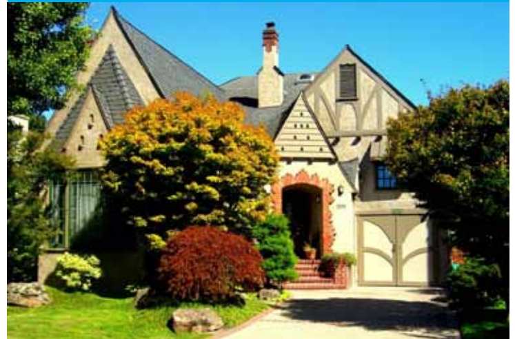
Burnley residence, 1622 Moreland Drive, 1928.