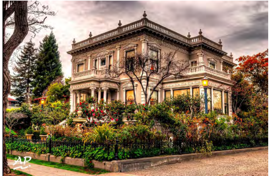
Charles Tilden House, San Antonio Avenue.