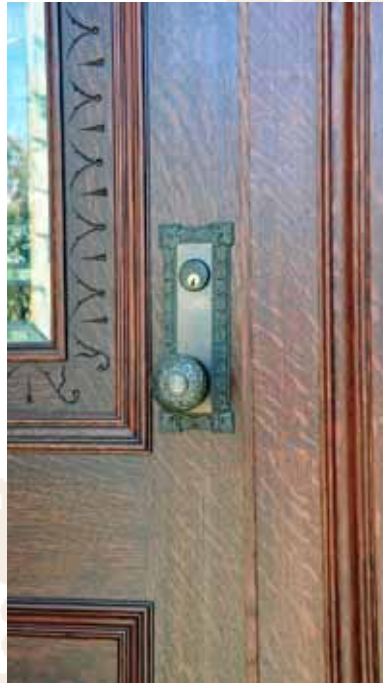
Victorian entry door, detail showing refreshed carving and restored original lock set.