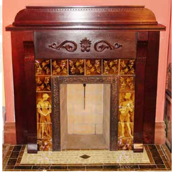
Victorian mantle after paint removal and refinishing.