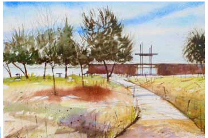
Walk To Crab Cove 10" X 14" 200.00