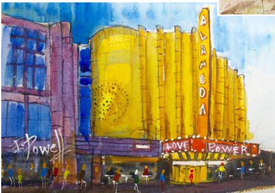
Alameda Theatre 10" X 14" 200.00