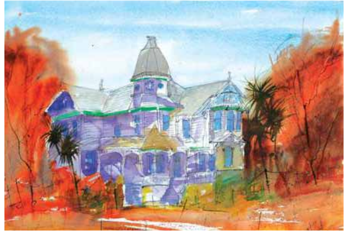
Alameda Victorian 10" X 14" 200.00