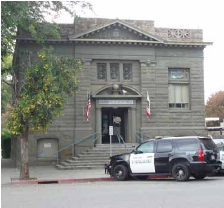
The Colusa Carnegie Library, at 260 Sixth Street in Colusa, California, built of Colusa sandstone. The Carnegie library built in 1906 now houses the Colusa Police Department. It was listed on the National Register of Historic Places in 1981, and is one of many local Colusa sandstone sites in the county.

(c. 1908); and three Home Telephone Buildings (1908). Besides the rich connection of Colusa sandstone to San Francisco, the product was shipped as far away as Honolulu, Hawaii. It was also used locally where it is best represented in the Colonial-Revival Colusa Carnegie Library (1906), a National Register-listed historic property, in addition to the 1902 Alameda Free Library. The unusable pieces of sandstone as stone particles were utilized as railroad ballast and road macadam, a preferred material for wagon roads. Macadam, a bituminous material mixed with stone aggregate was valued as an early form of asphalt. Adjacent to the Alameda Free Library, a driveway off Santa Clara Avenue appears to be made with Colusa sandstone macadam.