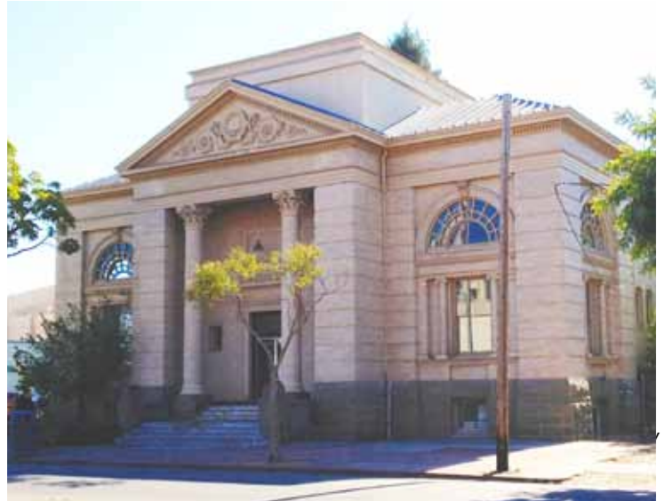
The Alameda Free Library, a Carnegie library was built in 1902 with Colusa sandstone. It was the first designated building for the city's library, which had previously been housed on Park Street and at City Hall.

In 1914, the C&LRR dissolved, and with no railroad to ship the material, both quarries ceased operations and all assets were liquidated by 1915. Some claim the use of innovative and less expensive building materials, such as Portland cement and an increased use of steel as lighter framing, caused massive solid stone buildings to become too costly and they were no longer being constructed.