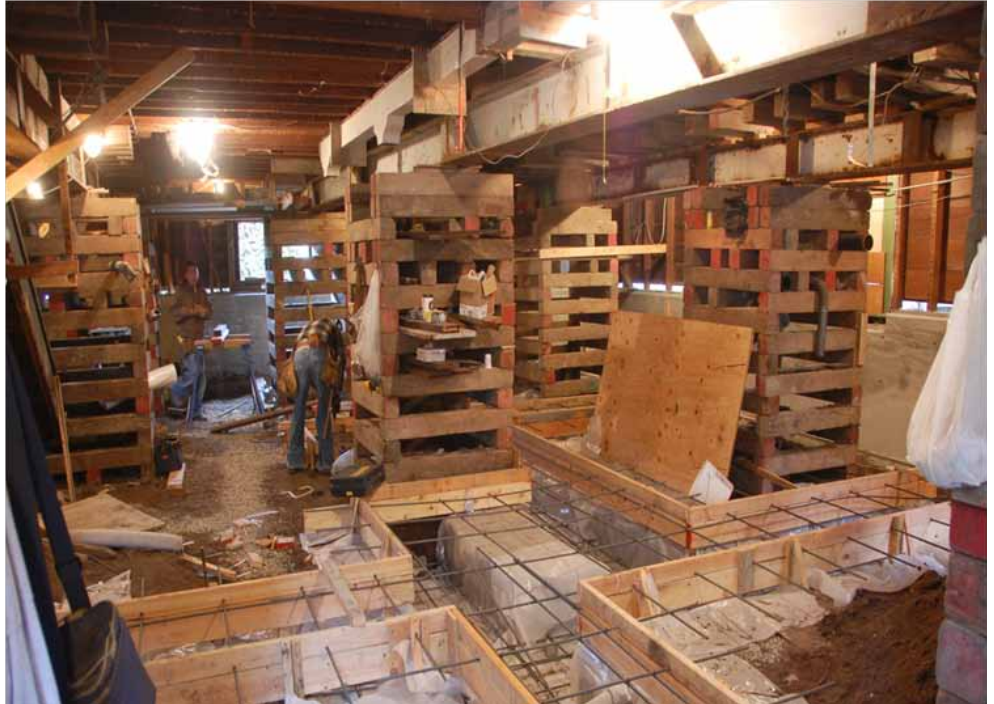
This is the business end of foundation construction. Image shows how the house is supported while the construction is proceeding.