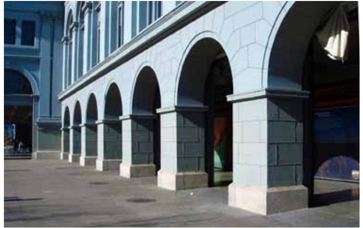
San Francisco's Union Depot & Ferry Building was the largest construction of Colusa sandstone in the city. The building survived the 1906 earthquake, showcasing the strength of the product. The subsequent demand made Colusa Sandstone the leading provider of sandstone in the state.

marketed to master architects, such as Willis Polk, A. Page Brown, and Coxhead & Coxhead, to construct luxurious buildings in the City with Colusa sandstone.