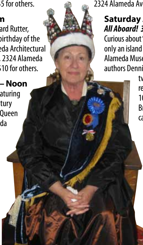
Queen Victoria assumes the body each year to visit Alameda, where more than 4,000 buildings are named in her honor.