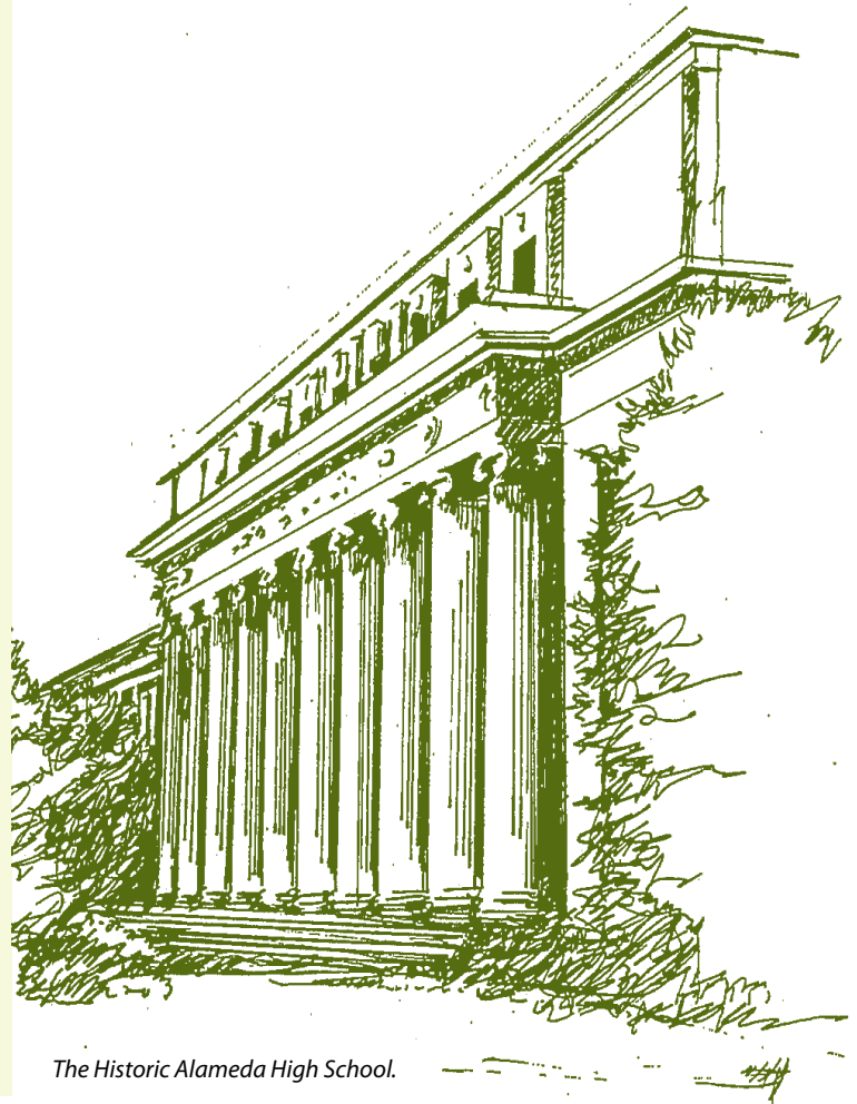
The Historic Alameda High School.

www.cityofalamedaca.gov/About-Alameda/Historic-Preservation