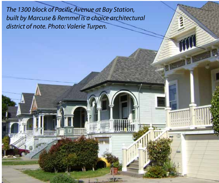
The 1300 block of Pacific Avenue at Bay Station, built by Marcuse & Remmel is a choice architectural district of note.