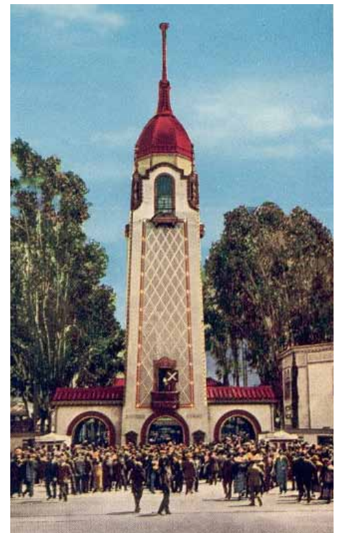
The tower entrance to Neptune Beach once graced the foot of Webster Street.