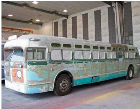
A bus from the early 1950's being restored by American Bus Repair, one of Bldg 024's tenants.

Coach Specialties, which several years later became American Bus Repair, LLC, was the first private business to reoccupy Building 024. This large