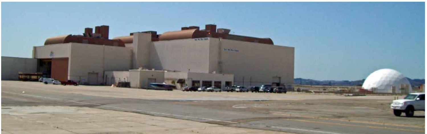
Encompassing 63,000 square feet, Building 024 and its smaller satellite Building 024A cost $19,251,343.00 to construct. Inside, there are three large high-bay aircraft painting hangars, each one about 130-ft square.