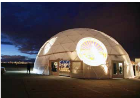
A geodesic dome built by Rock Wall Wine Co., and Area 51, accommodates events both large and small, and provides sweeping views of the Bay.

There has been much free association and sharing of spaces by all the building's tenants. Their symbiosis has been truly amazing, offering great fun for observers, customers, and employees alike. Where else can you enjoy a glass of truly excellent wine while your bus is being painted, and watching an airliner go up in smoke or myth busted right in the middle of your billion dollar view of the Bay?