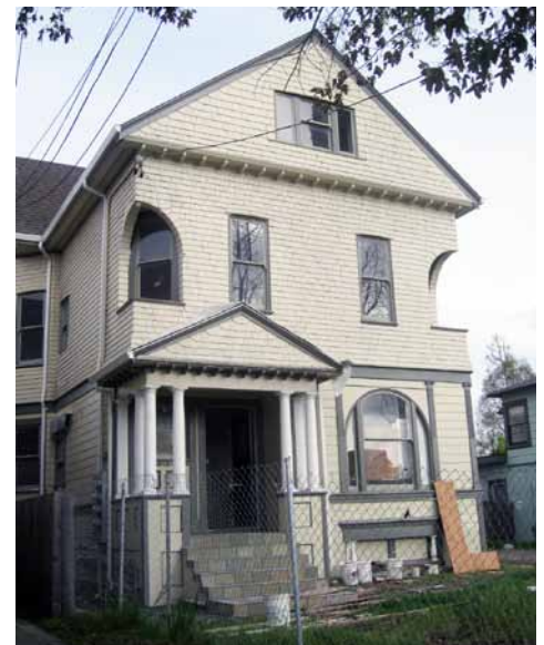
2010 photo showing renovation nearing completion. Note replication of original details: slight bulge of gable above window, upswept shingle courses at gable edge, and sawtooth shingles on bottom course.

The house at 1524 Bay Street recovered first from the 2006 fire and second from a hasty initial reconstruction project designed without benefit of the City's Design Guidelines. We would like to acknowledge the accomplishments of the previous owners, who had the understanding and foresight to tear out the first reconstruction work and the patience and dedication to preserve the historic character of their house. In addition, we would like to recognize the initiative and resourcefulness of the new owners for carrying the renovation through to completion, making the house an inviting home that contributes to the historic streetscape once again.