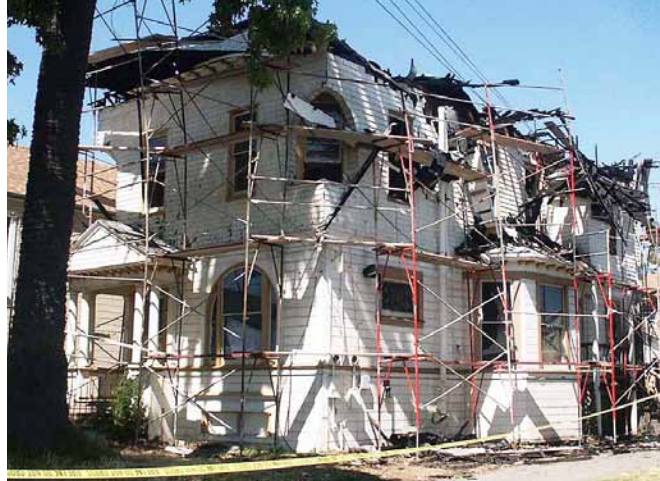
A 2006 photo showing the aftermath of fire, with roof and attic completely destroyed.

F ire! A home renovator's nightmare. In July 2006, the two-story Queen Anne house at 1524 Bay Street was caged in scaffolding, undergoing a renovation and observing the 114th anniversary of its birth. A fire broke out and consumed the roof, the attic, the beautiful front gable and its window, and portions of the second floor. The rest of the structure was somehow spared destruction but doubtless suffered significant smoke and water damage.