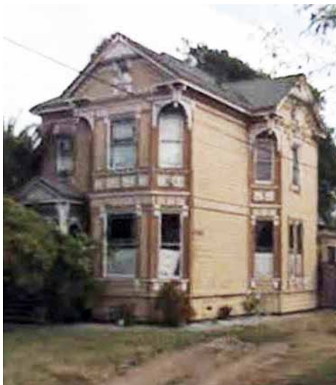
For many years the house suffered neglect and deferred maintenance.