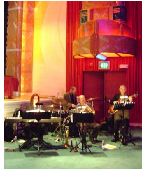
The Franz-Nichols Band provided music for the reception and throughout the award presentations.