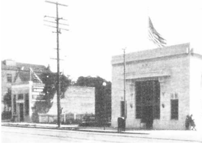
Left: The WESCAFE started as the office building for the West End Building Association, built by the Powell Brothers in 1916. This structure and the Alameda Savings Bank (right) and the Neptune Theater—were the first brick structures built on Webster Street.