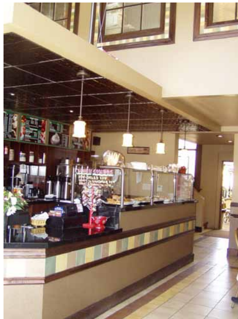
Traditional tilework on the floor and dark wood trim work is reminiscent of the building's 1916 vintage. Stamped sheet metal ceilings and period light fixtures complete the period ambience.

While this small renovation project seems modest in the large scheme of things, in fact, it's a very important building in the context of Webster Street and commercial development in Alameda. The building is eligible for the California Register of Historic Places and the community is thankful to the Trejos for bringing this distinguished jewel back to life—it's a wonderful example of adaptive reuse done right.