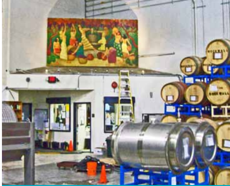
Rock Wall Wine Co.'s Winemaking Room in Bldg 024 is the new home for a historic mural once located in the B.O.Q.'s Dining Room.