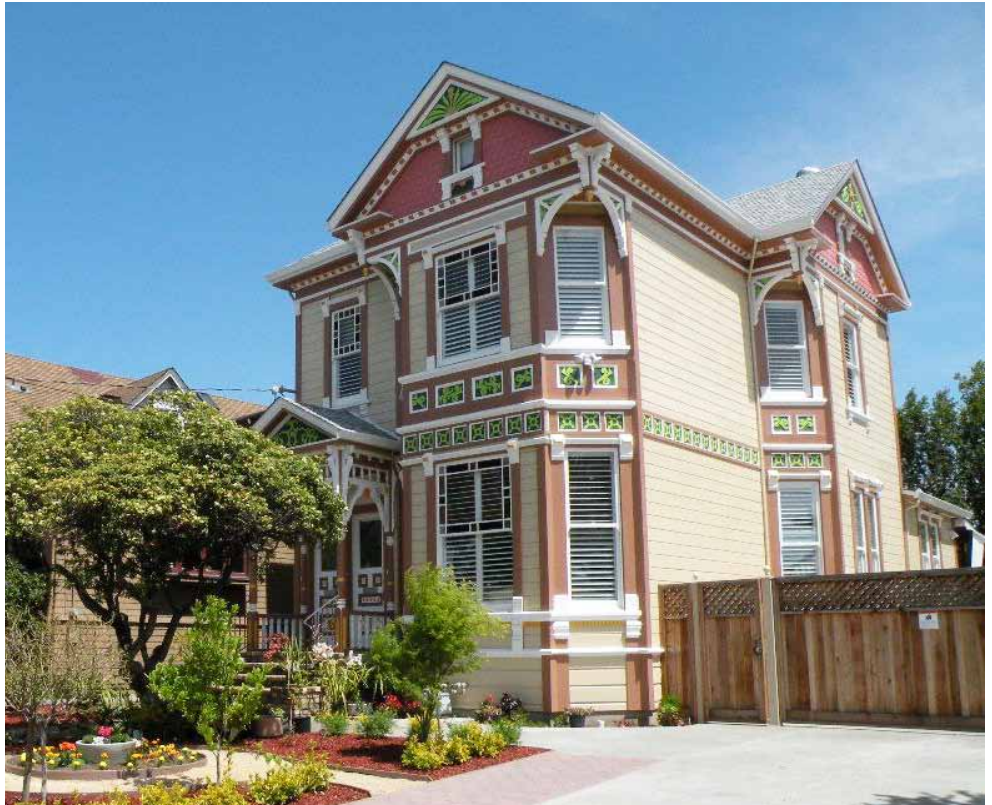
1356 Broadway is now restored with a great amount of attention to detail and quality workmanship both inside and out.

Fortunately the Yuens were up for the challenge(s). There were many. One of the most difficult was the daunting task of removing the debris and filth left by the upstairs tenants and