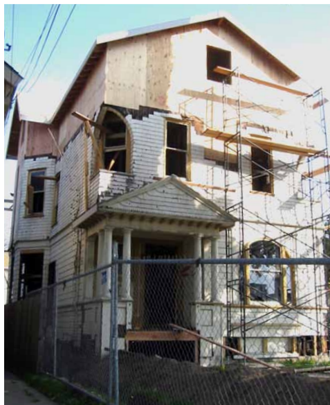
2007 photo showing initial reconstruction. Roof pitch is shallower than original, and second floor ceiling appears to have been lowered.

Recovery and reconstruction began, with a rebuilt attic designed to serve as a game room. After the new roof and walls were completed, observant passersby noticed that the rebuilt house looked much different from the original, which had been designed by Howard Burns and built by D. Straub & Son in 1892. The roof was flatter and the attic appeared to be higher, with perhaps a lower second-floor ceiling to provide extra space in the attic. The structure had lost a significant aspect of its Queen Anne identity. The City of Alameda