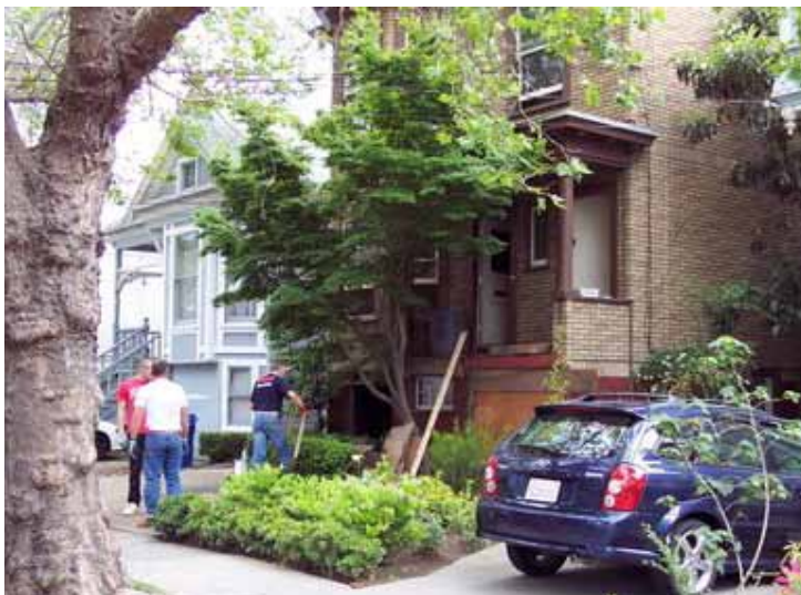
Work begins on the Central Avenue residence. Rehabilitation included the removal of the front steps, the "waterproof building manila" a brick-style siding, and the tree obscuring the front elevation.

Inside, while they were scouting around in the basement, they discovered a redwood banister, took it upstairs, and said, "Voila! It used to be up here." They were happy to reinstall it in the house.