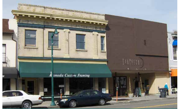
The east end of the City Market Building was sullied by stucco in 1954, rendered smooth and deprived of detail.