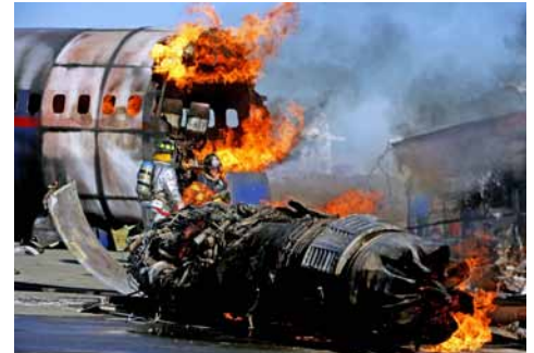
The NBC show "Trauma" used the former Alameda Naval Air Station runway to depict a fiery plane crash and emergency rescue efforts by land and air.

vehicle painting and repair business has been in residence for some ten years. A famous painting of theirs is the jet in front of Encinal High School.