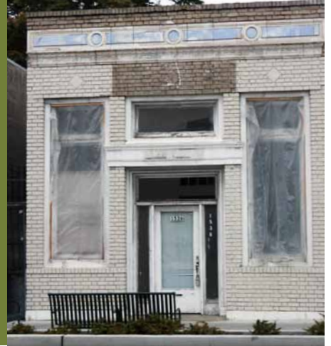
Right: For many decades, the building housed a bank which closed sometime in the 1980s. It then housed a frame store for a couple of years, but after that, it sat neglected and blighted until restoration began in 2008.

wood buildings on the north end of the block are complemented by single-story brick commercial buildings on the south end, reflecting the commercial development of the area from about 1875 when the West End Victorian resort boom started until about 1920 when development was spurred by shipyards and different construction materials. Monica and Miguel's rehabilitation used simple materials to create a distinct and friendly café. The design retains the tactile character of the original building and celebrates traditional materials.