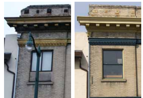
Left: During the 1970s two wooden windows were replaced by shorter aluminum ones, finished off with faux brick contact paper.