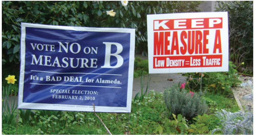
"Vote No on Measure B" signs decorated numerous properties across Alameda before the initiative was defeated in the February 2 election.

Needless to say, after the election SunCal's Specific Plan is not in compliance. However, this plan was very problematic from the beginning. It does not provide necessary transportation infrastructure to support a massive development of 4,700 to 5,500 homes. It calls for over three quarters of a mile of 5 to 6 story housing units, with no set back, reaching the height of 60 feet, with high-density housing placed above residential parking. This type of housing project configuration, with parking on the first level would alleviate SunCal's requirement to perform environmental clean up of the land to a residential standard, as publicly stated by a SunCal representative. His plan is very similar to types of developments you may see in Emeryville. However, it is not in keeping with Alameda's approved Community Reuse Plan (1997) and Preliminary