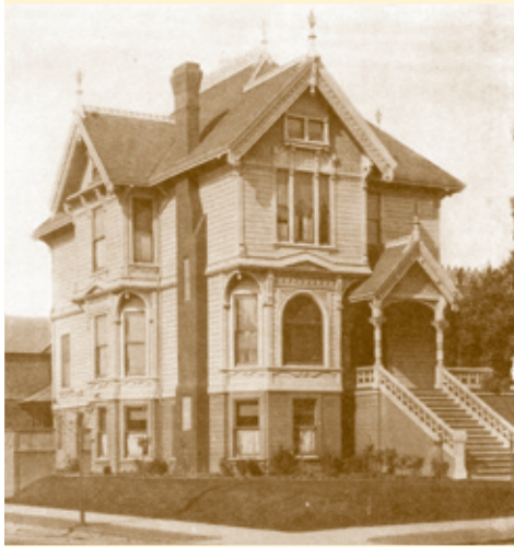
A Queen Anne with vestigial Stick elements adorns the corner of Grand Street and San Jose Avenue in Alameda.