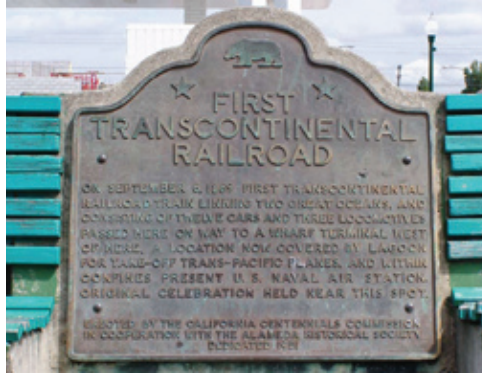
This plaque and bench on Lincoln Avenue at Webster Street, commemorating the First Transcontinental Railroad that arrived in Alameda in 1869 was destroyed by an auto last November. The Public Works Department is currently working to restore the monument to its original configuration.