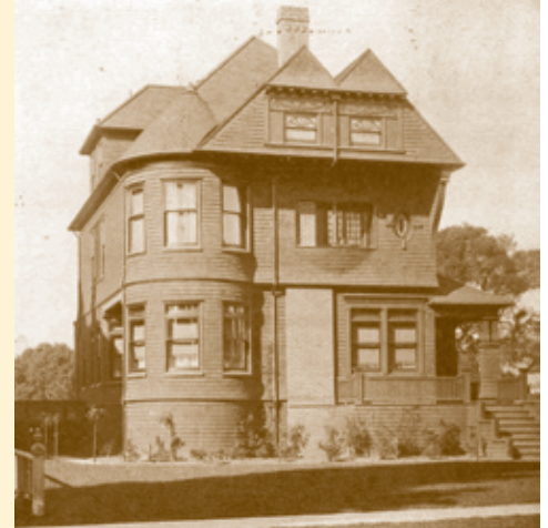
A shingled Queen Anne home also on Grand Street, Alameda.

On graduating from Encinal High in 1987, with world travel and his art education in mind, he took a leave from his job with UPS and enlisted in the Army where he enjoyed living in Northern Germany for several years prior to his tour of duty in Operation Desert Storm in the Persian Gulf. He finished his tour in '91. Returning home to Alameda, California, he resumed his job at UPS