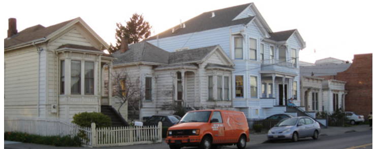
Nonresidentially zoned Victorian houses on Buena Vista Avenue east of Park Street.

AAPS encourages its members to attend these meetings.