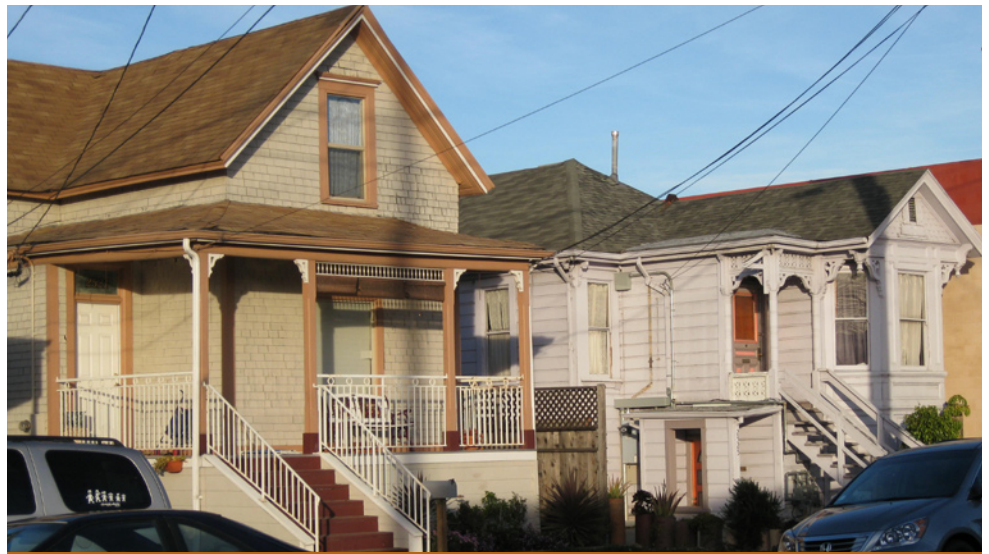
Houses on Clement Avenue between Everett and Broadway now zoned industrial. Clement Avenue proposed under Strategic Plan as possible new location for auto-oriented uses relocated from Park Street.

"I got started in this business talking to people; we will always have knowledgeable people that can answer your questions. I like that kind of business."