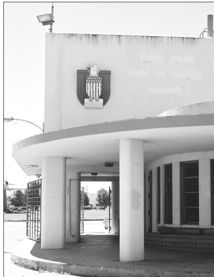
Above: Main Gate Guardhouse

In July 2007, SunCal reached an Exclusive Negotiating Agreement with the City and has begun the preparation of a Master Plan for Alameda Point. There will be a series of community meetings to gather public input on