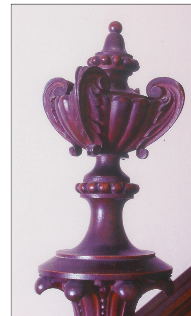
Above: Newel post from the Stanford Mansion Right: Furniture Panel

Parking available behind the church, enter from Santa Clara • Doors open at 6:30 PM • $5 for non members