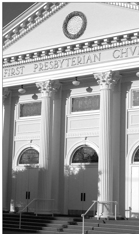
Façade After Renovation

forced foundation, and then ran the full height of the front façade to be anchored into the attic joists above. This wall was then replastered and the original architectural trim pieces were replaced in their original locations. Once complete, the flexing was corrected.