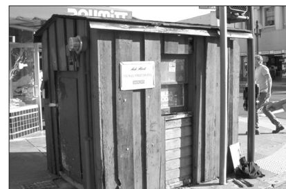
Above: Before Below: After

Note: Portions of this article were taken from the August 17, 2006 dedication ceremony brochure.