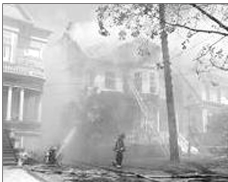
← 1011 Grand St. in 1979 → Three alarm fire in 2003 and devastating results