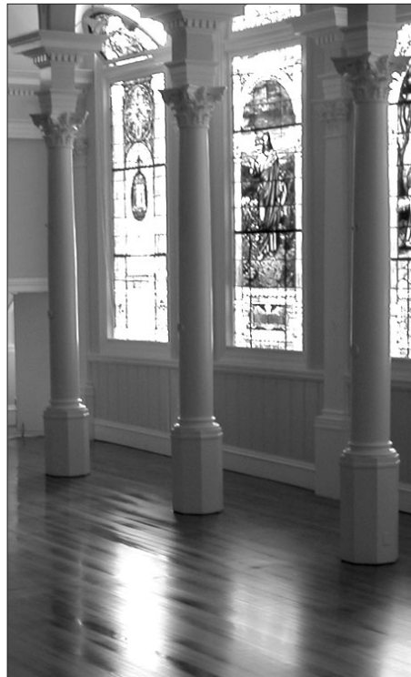
Stained Glass Windows

The south shear wall facing Santa Clara had weakened to the point that it was flexing. This created many cracks in the wall that were replastered and repainted but these actions did not solve the problem. The wall had to be strengthened. The solution to correct this problem involved the rather tedious but necessary tagging for replacement and careful removal of all architectural trim around the windows, doors, ceiling and floors on both levels. Once the plaster was removed, the workers installed continuous 3/4" plywood reinforcement that was anchored into the newly rein-