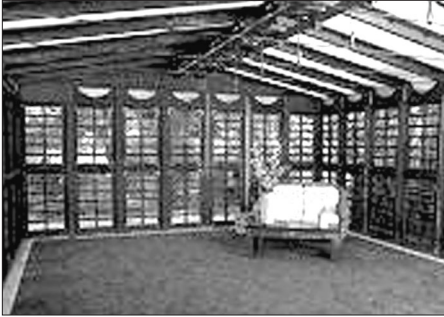
Artistic Sun/Garden Porch Addition added in 1980

The homeowners, their restoration team, and the City of Alameda all agree that this magnificent renovation effort was completed with great style, workmanship, love, care, enthusiasm, and a magnum of close attention to detail. All innovations were designed and decided upon based on bringing the home up to modern standards while keeping its true original style and character.