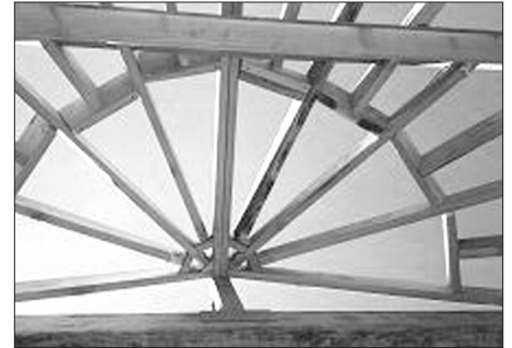
Roof Framing of the Belvedere Window

The most challenging restoration element to overcome during the project was dealing with the water saturation. Fortunately, some of the water saturation/soaking effects dried out as the construction proceeded—providing much needed time for getting specifications,