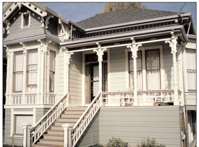
After photo by Jesse Garza