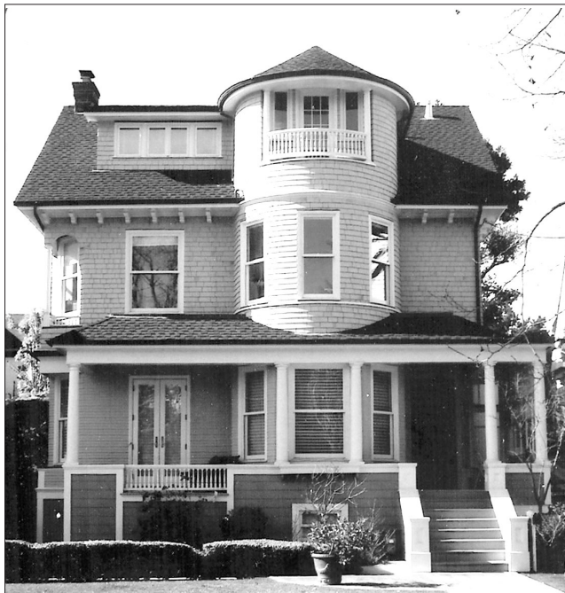
1011 Grand Street—Post fire renovation