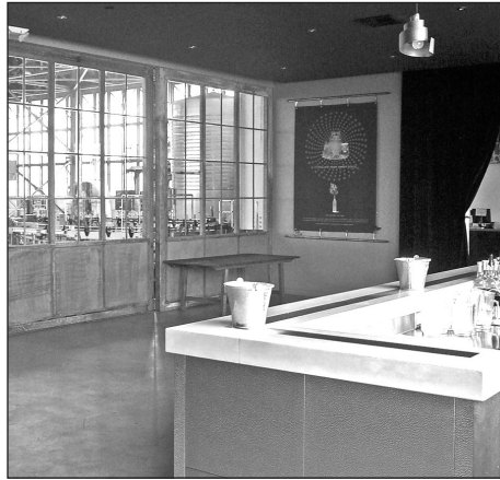
St George Spirits' Tasting Room

As time went by, St. George Spirits more and more seemed lost behind and between growing stacks of Rosenblum's wine barrels, and the firm decided that it was time to look for new space. Three years ago, they leased all of Hangar 21 at Alameda Point. The location offers plenty of parking, and the hangar itself is a 65,000 square foot, high bay space with few columns. By the nature of its construction, Hangar 21 lends itself well to tall distilling towers, fermentation tanks, and product holding tanks. Business offices are on second level mezzanines, while the entire production and storage of St. George Spirits' varied product lines