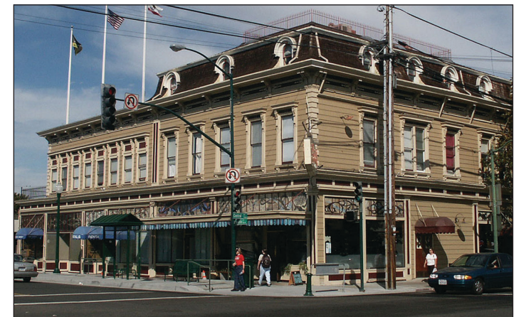
Historic Croll's Building, northeast corner of Webster St. and Central Ave.