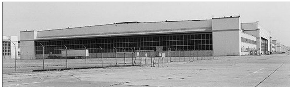
Seaplane Hangar 11 (looking east)

However, the PDC would severely affect the NAS Historic District by demolishing all of the Senior Officer's Houses ("Big Whites"), the Bachelor Officers' Quarters (BOQ) and a number of shops buildings, all of which tell the story of the NAS's role in World War II. While the PDC claims that 65% of the district contributors would be preserved, numbers alone do not adequately characterize the extent of the effects to the historic district.