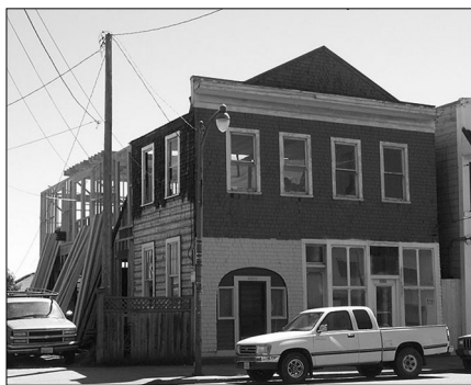
500 Central on August 8, 2005, when the City issued a stop work order to halt illegal demolition and construction.

The property has a recent history of questionable construction activity, including a demolished building at the rear that the owner claims collapsed by itself and work on the main structure in early 2005 without permits.