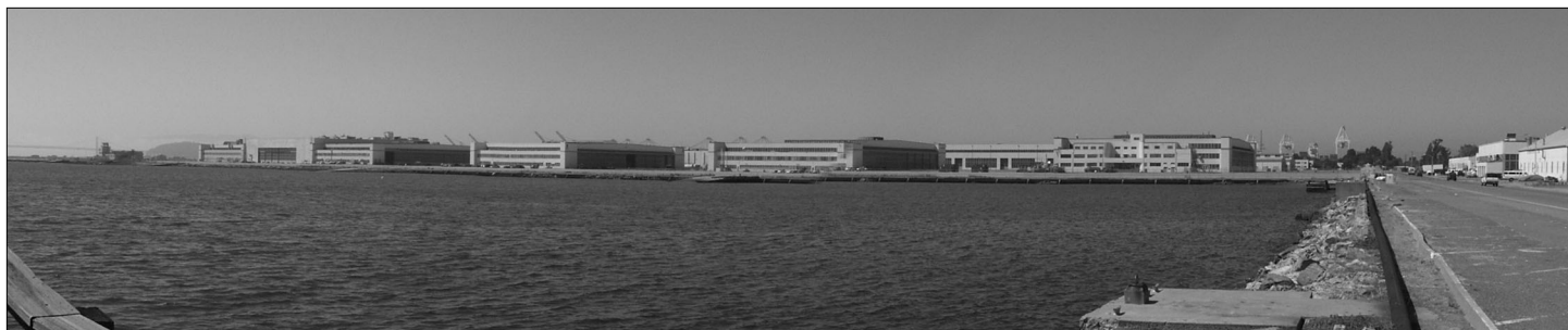
Panorama of the Seaplane Lagoon and seaplane hangars (looking north)